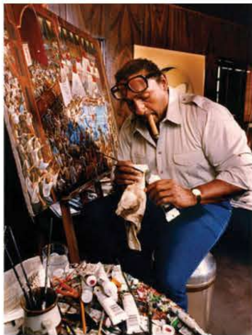
Ernie Barnes working in his studio in 1992.

After being drafted by the Baltimore Colts in 1959, Barnes played professional football for teams including the Denver Broncos and San Diego Chargers until 1965, before pursuing his passion for art .