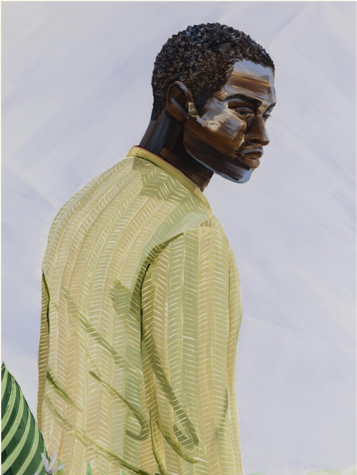
Greg Breda, Devotion, 2022, Acrylic on vellum, 60" x 40" | 152.4 x 101.6 cm, Framed: 65 5/8" x 45 5/8" x 2 | 166.7 x 115.9 x 5.1 cm